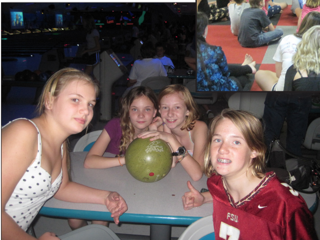
At left, four Trinity Youth enjoy a night of bowling with possibly the largest green olive in the world (okay, it's really a bowling ball, but seriously).