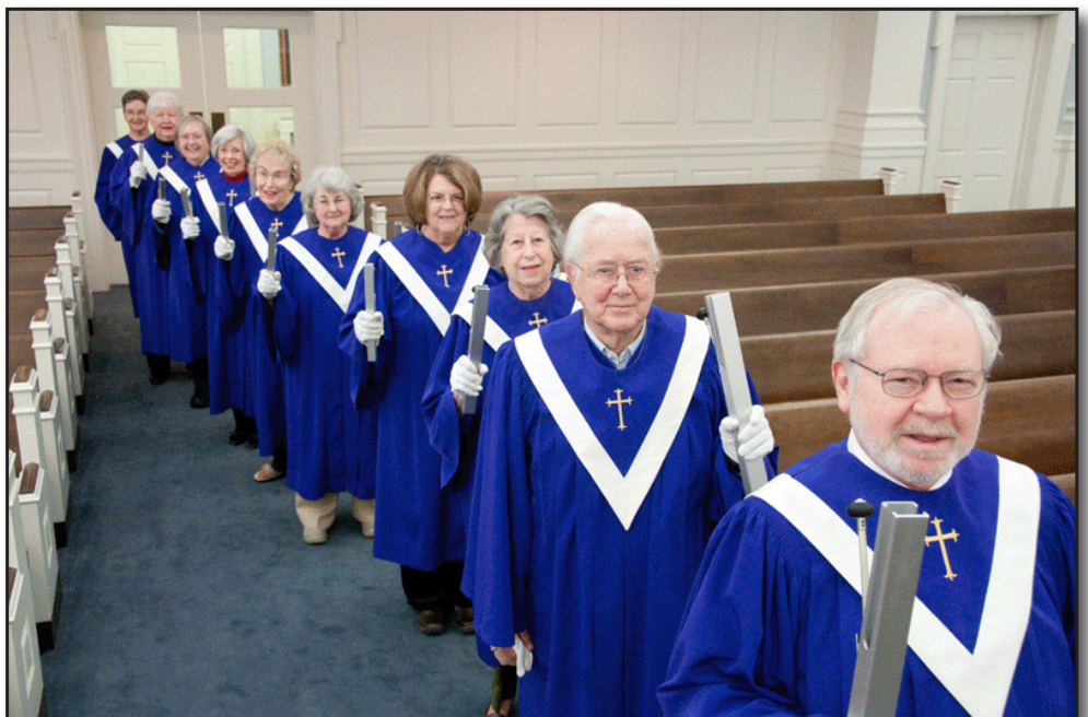
The Senior Handchimes ring for worship several times each year.