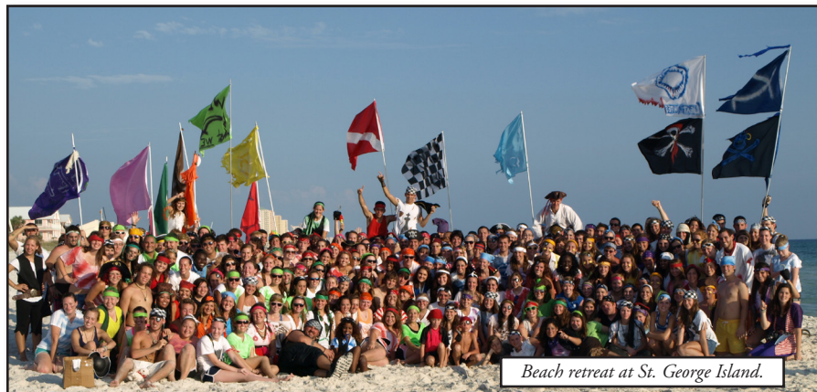
Beach retreat at St. George Island.

If you can't attend but would like to help support the FSU Wesley Foundation, you can make a donation online at www.FSUWESLEY.com or contact Wesley's office at 222-0251. In addition, if your employer participates in the United Way Campaign, please consider designating your contributions to the FSU Wesley Foundation. Thank you in advance for your support. Not only will you be investing in the continued growth and sustainability of the FSU Wesley Foundation but you will be investing in the future leaders of the United Methodist Church!