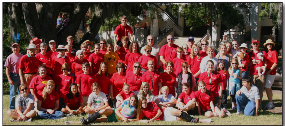
Trinity has been an ardent supporter of CROP Walk for many years. This is a photo from the CROP walk in 2010.

In this country of plenty, with its well-stocked grocery stores and abundant restaurants, real hunger is something we don't often think about. Yet according to figures provided by Church World Service, the number of people who don't have enough to eat is staggering. In the U.S., more than 43 million Americans lack enough to eat. Worldwide, over 1 billion people—one out of every seven people—are hungry. Each day almost 16,000 children die from hunger-related causes – one every