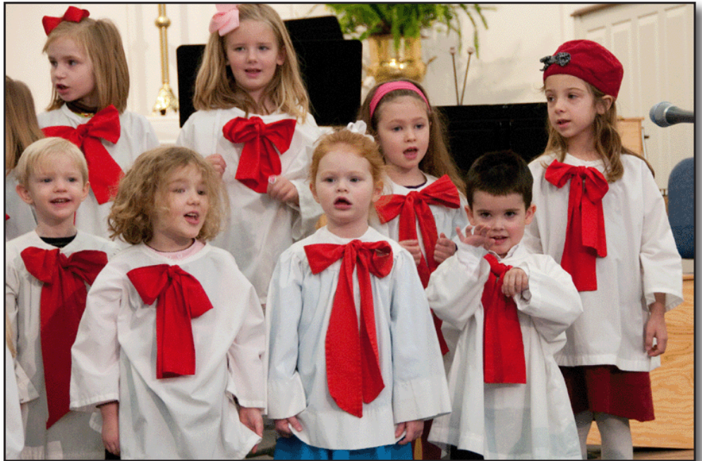
The Cherib Choirs are always a crowd pleaser.

Check out our website www.tumct.org for more information on the music groups here at Trinity!