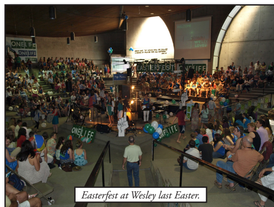
Easterfest at Wesley last Easter.

Here's where you can help. A special Wesley Dessert Fundraising Event will be held in Moor Hall, on November 3 at 7 p.m. There will be a program about Wesley,