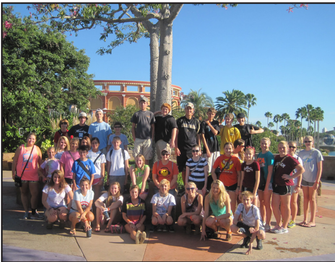
In the photo at left, over 40 youth and adults travelled to Orlando for "Rock the Universe," which is an annual Christian rock concert featuring some of the finest performers. The Trinity Youth have been regular attenders to this event for several years.

enjoy it but most of us would rather be at the beach.) Unfortunately, I think there are a few people who think this way about coming to church. For most of us, we love it here at Trinity; we can't imagine being anywhere else, or not having this family to go through life with. The idea of having our children grow up here, get baptized and confirmed here, even married here goes without question. We can't imagine calling any other church home. But for others, they see church as something they should do or have to do , rather than something they want to do or get to do . I know it has made all the difference with my family and probably yours too. I just wish we could convince others of the same thing. Church is important and it keeps us healthy! Aren't we lucky to call Trinity home?