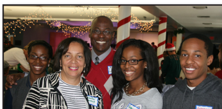
Trinity helps families connect at Christmas time.

The dinner also offers the opportunity for folks to volunteer to help, because as you can