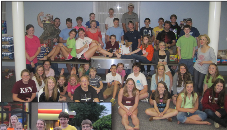
Above, Trinity youth packaged over 200 snack packs for the homeless! At left, the Mid-High madness group goes out on the town. Below, High-school Late Nite - looks kinda scary.

it we have to tell everyone about it? Well, I am. I am currently in the Disciple Class which reads most of the Bible in 34 weeks. I am really enjoying it and trying to learn as much as I can (at least as much as my brain can hold). I have been familiar with lots and lots of stories from the Bible my whole life; however, reading it cover to cover is giving me so much more insight about God and his relationship with us. After all these years, God hasn't changed and neither have we! We are still human, sometimes getting it right and sometimes getting it wrong. God is still the gracious and merciful God who loves us so much he gave us his son, Jesus Christ. And yes, Jesus is the reason for all the Christmas hype and the reason we celebrate this time of year. But this year I will be more focused on God, not baby Jesus, and how much he loves us, even when we mess up!