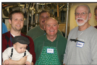
In this photo, three generations set a good example for the fourth.