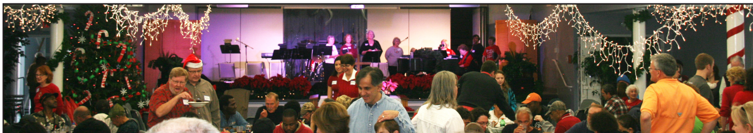
Let's see, Christmas dinner - check; Christmas tree - check; Christmas lights - check; fellowship with the church and community - check; cozy ambience - check!