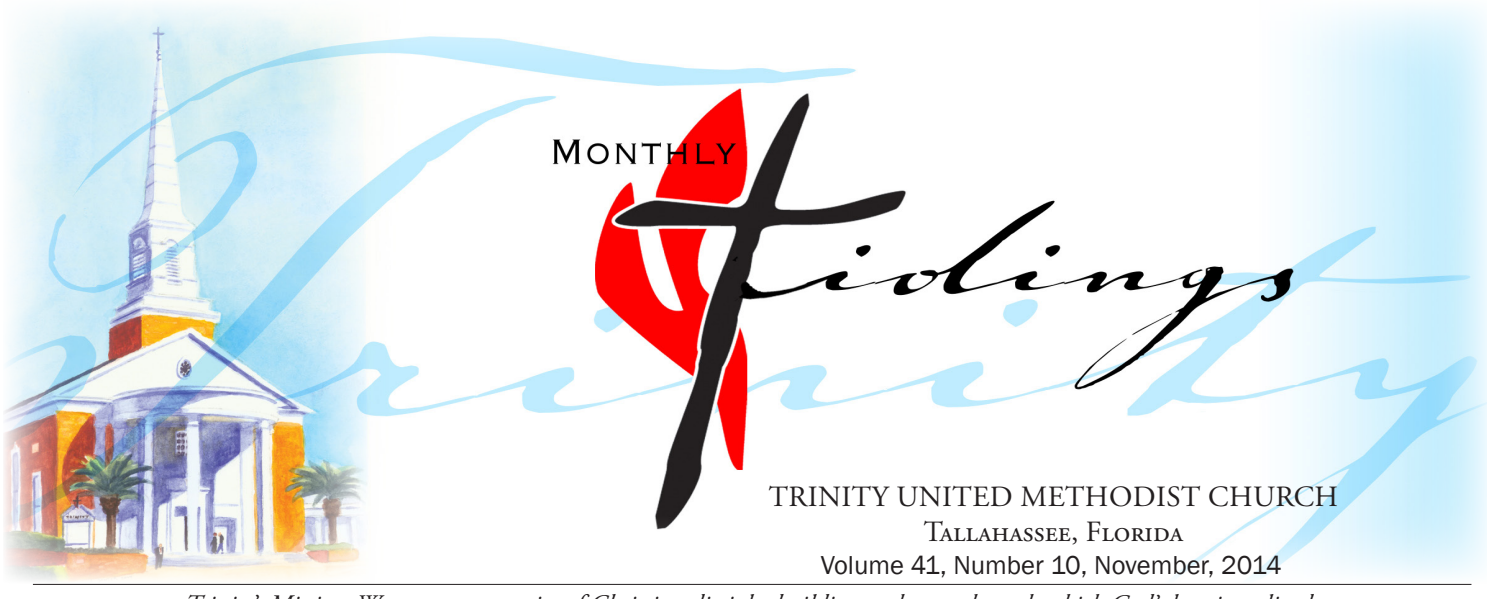
Trinity's Mission: We are a community of Christian disciples building pathways through which God's love is realized.