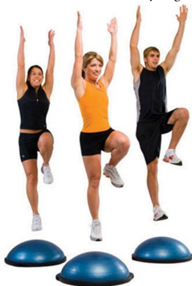
The BOSU torture device - this looks so fun and easy!

Our exercise classes always have cutting-edge exercise equipment and our latest 'torture' device is the BOSU (BOth Sides Utilized). It looks like someone cut a huge ball in half and glued it to a platform. It's great for all kinds of exercises and Beth will probably make us do all of them and smile while we're at it. Drop into any of our classes and have fun while you get fit.