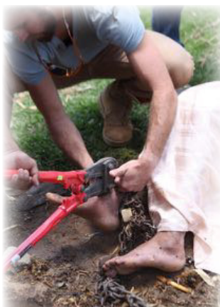
The chains are removed!

• Over-the-counter medications such as aspirin, Tylenol (adult and children's), ibuprofen (adult and children's), artificial tears, Aquaphor ointment, hydrocortisone cream, anti-fungal creams, multivitamins for adults and children (no gummies please), prenatal vitamins, Tums, Aleve (naproxen sodium), iron pills, cough and cold liquids/tablets (adults and children).