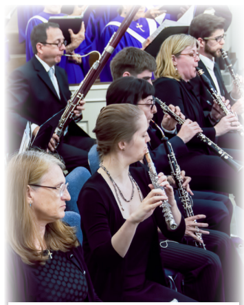
There are many classically trained musicians who play with the orchestra.

On occasion, the choir presents special concerts which are not part of our usual worship services. In recent years, this has