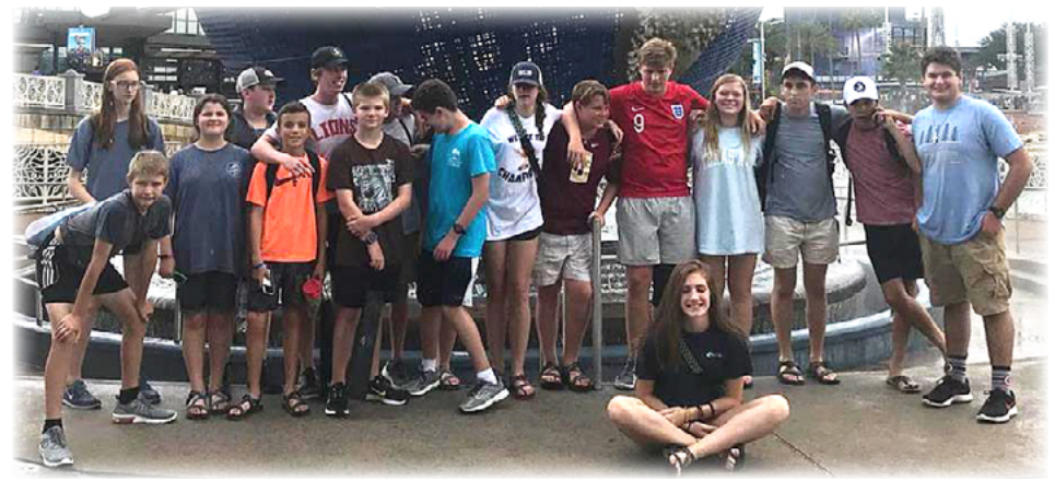
The traditional group photo taken in front of the Universal globe!