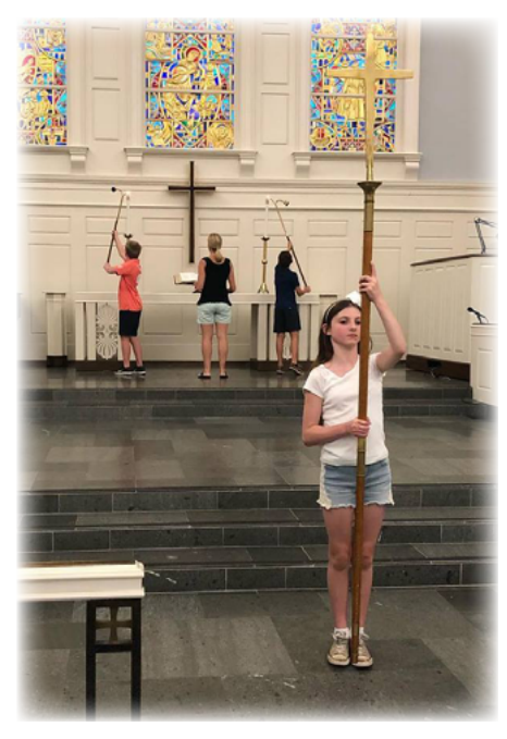
A new crew of acolytes are trained for Sunday worship.

With the school year in full swing, the regular rhythm of the youth program has begun to fall back into place. There are so many great opportunities for students ranging from 6th-12th grade. Many of you are very familiar with what goes on with the youth, but if you are new