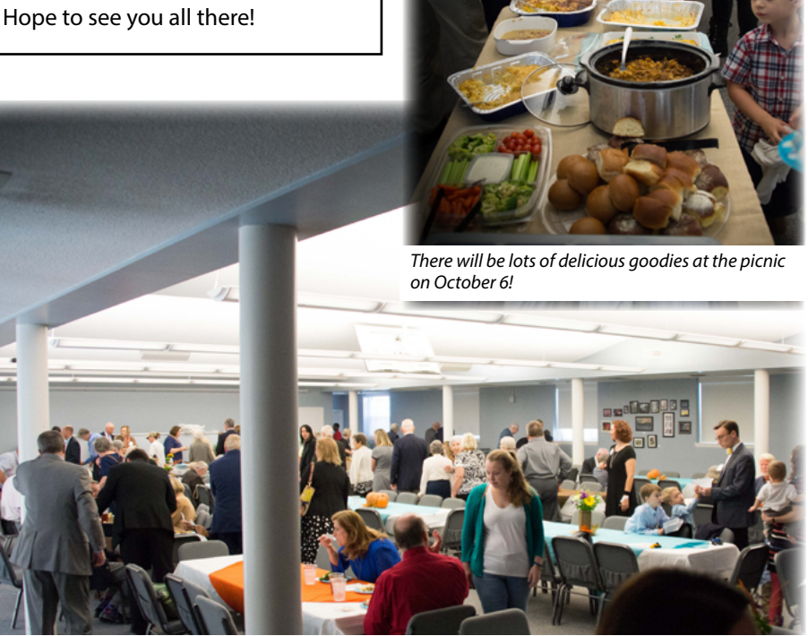
Don't miss this year's Church-wide Picnic at J Lee Vause park on Saturday, October 6 from 10:30 - 1:30.