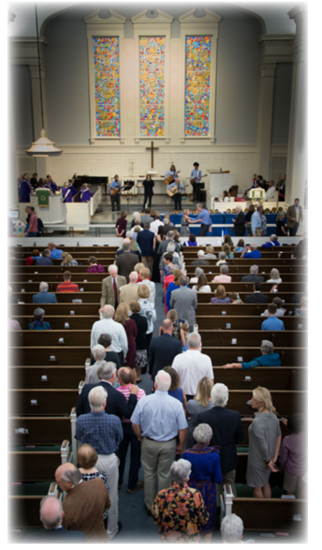
Stewardship Sunday will be October 14. Bring your committment card!

https://www.signupgenius.com/ go/60b0e45a4af2da0fe3-trinity