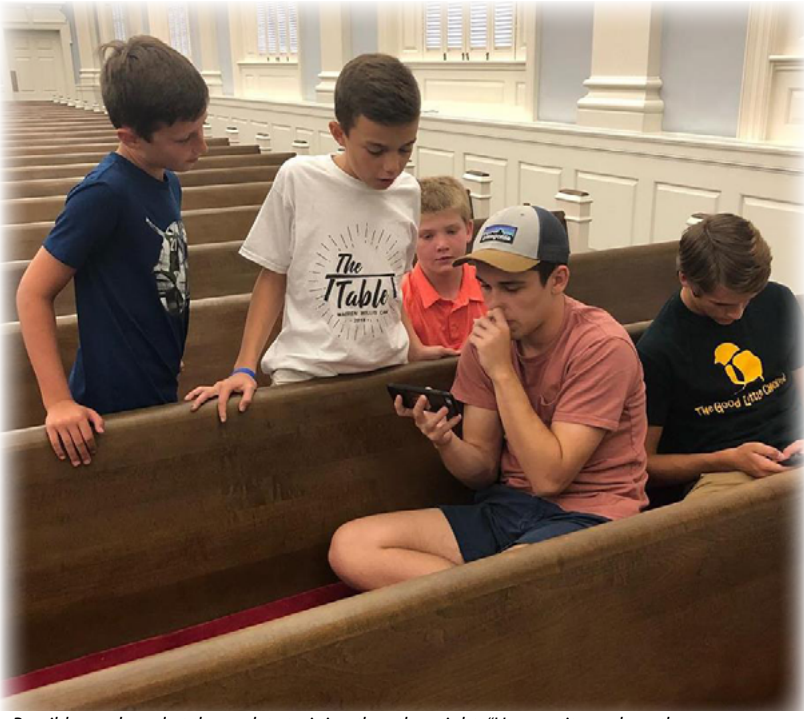
Possibly overheard at the acolyte training the other night. "Hmmm, it says here that you put on your acolyte robe first , and then you light your candlelighter thing." "No way!" "Way."

As always, if you have any questions, please don't hesitate to contact me at <a href="mailto:lprasse@tumct.org">lprasse@tumct.org</a>. Also, if you are not receiving weekly updates about all our upcoming events, send me an email and I will make sure you are on our list. Thanks for all that you do to support our youth here at Trinity!