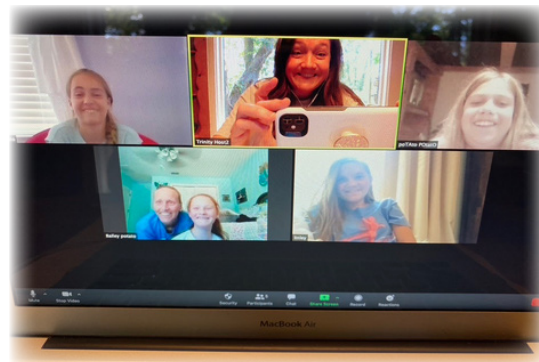
Being silly during a recent Confirmation hangout.