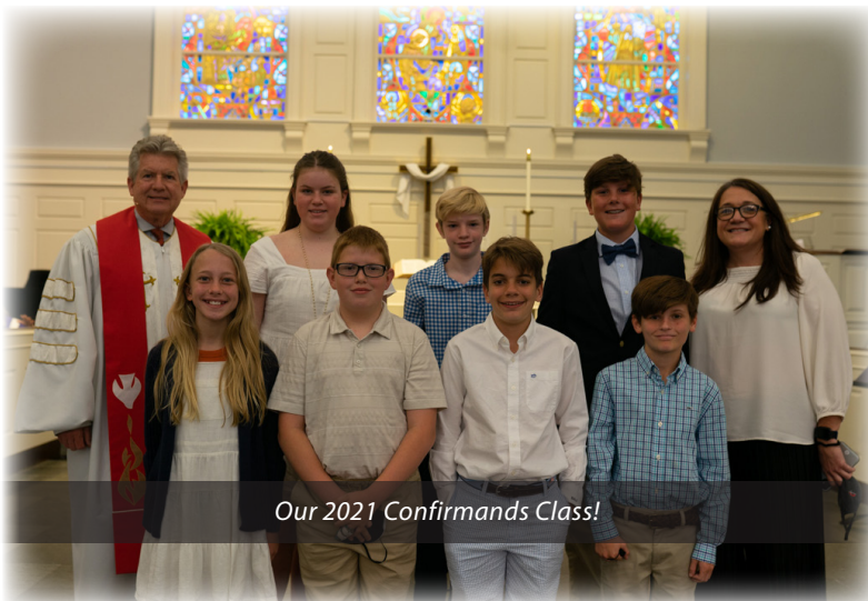
Our 2021 Confirmands Class!

http://www.tumct.org/connect/community/youth/