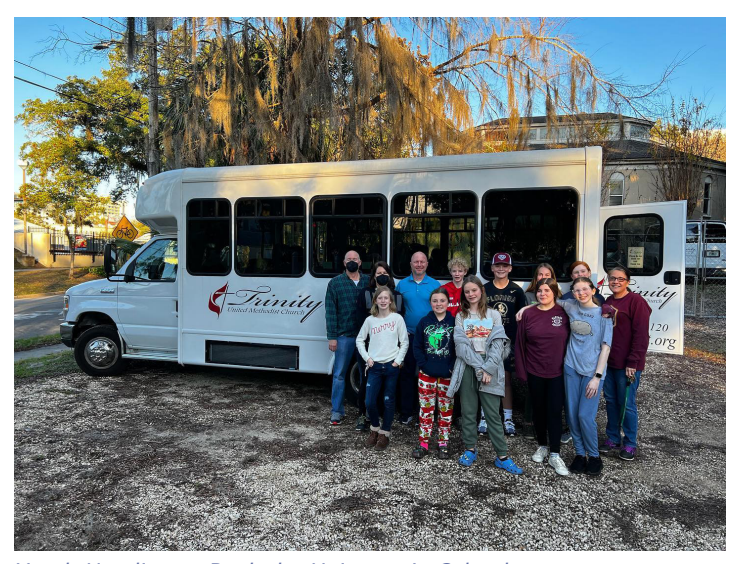
Youth Heading to Rock the Universe in Orlando

fter a wonderful cold and rainy February, your Trinity youth are ready for some springtime. The Youth doors have been wide open for a year now, and we're cautiously optimistic as we move forward. As I write this article, the youth and I have just returned from a fantastic trip to Orlando for a wonderful time of worship and fellowship at Rock the Universe. I confess to having been anxious being in such crowds of people, and I spent a lot of time talking to God about making that trip. We stepped out in faith and were blessed by it.