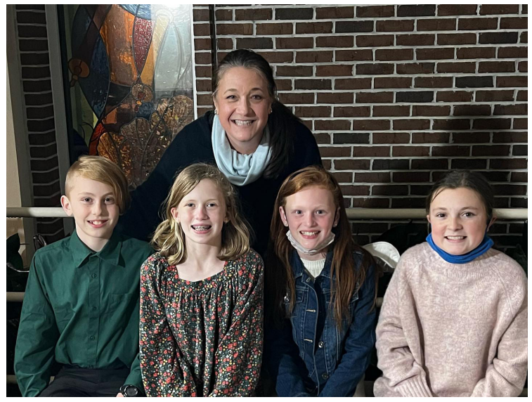
Confirmand Field Trip to Temple Israel

The confirmation class has been busy these past few months as well. We took a field trip to Temple Israel at the end of January. That evening we shared a meal, attended a service together, and had a time of Q & A after with the Rabbi. In February we visited St. Thomas More on our second confirmation field trip and learned a bit about Catholicism. We're having a great time learning how different denominations do things and why. This month we'll head to Warren Willis for our annual Confirmation Retreat, and I can't wait! This is a terrific time of growth for our confirmands, and I love being able to watch.